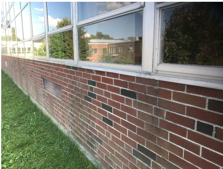
Photograph 10: Typical repaired caulking, vicinity of Doherty rooms 316-328