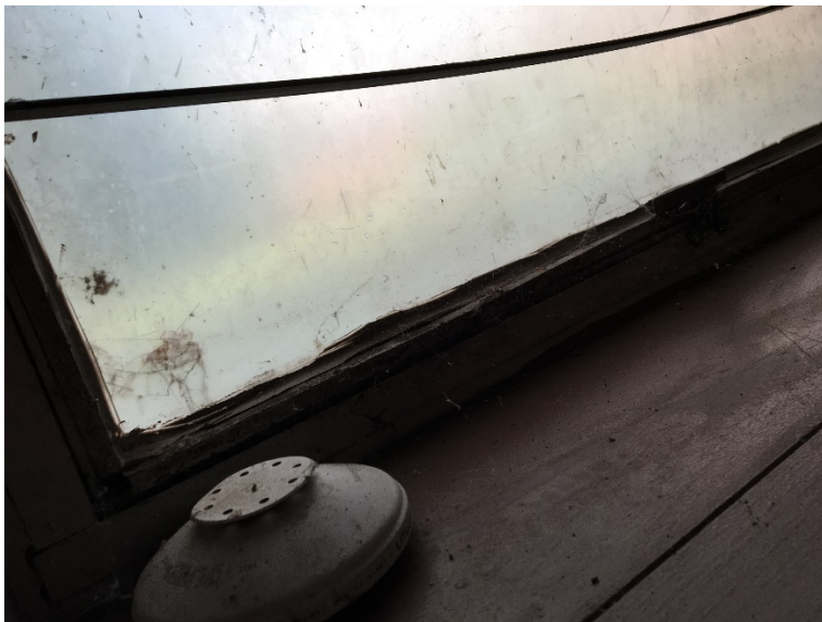
Photograph 8: Accumulated dust, Doherty room 301