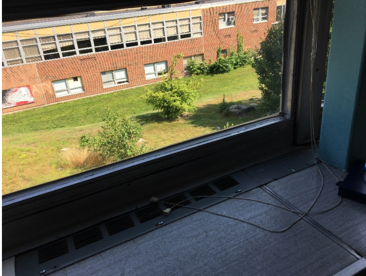
Photograph 5: Typical window caulk, Doherty Room 402