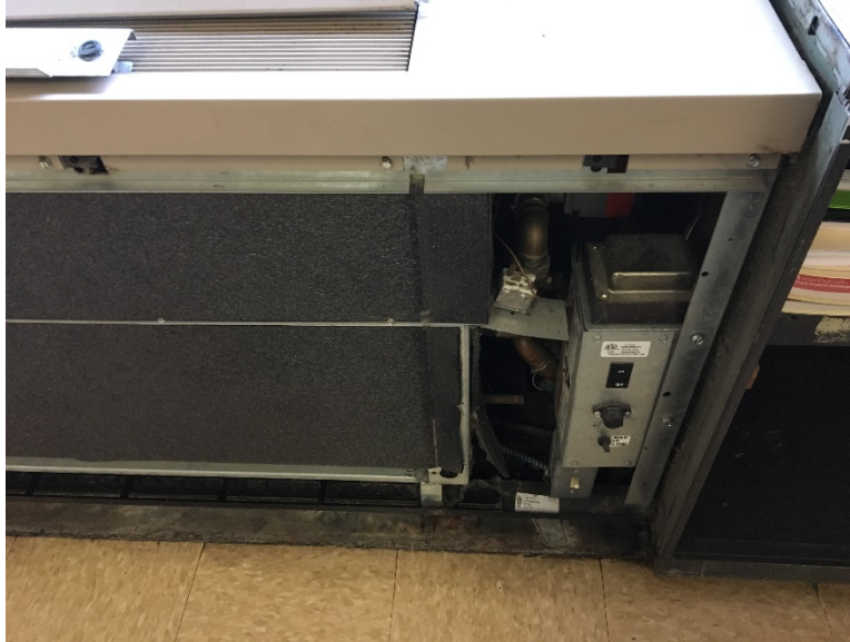
Photograph 1: Interior of Univent, Doherty Room 104