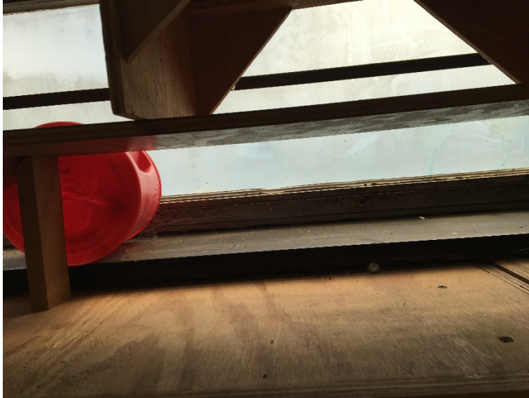
Photograph 7: Accumulated sawdust in Doherty woodworking classroom