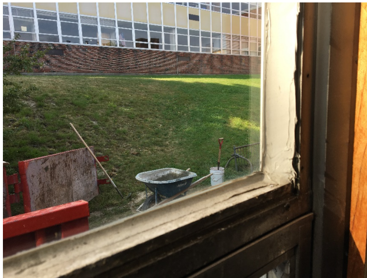
Photograph 2: Typical window caulk, Doherty Room 104