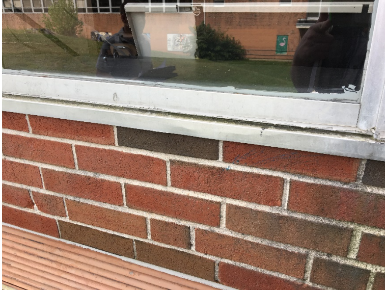
Photograph 9: Damaged exterior caulking, vicinity of Doherty rooms 316-328