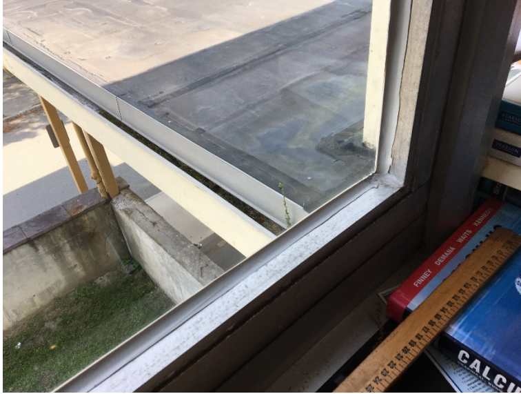
Photograph 3: Typical window caulk, Doherty Room 202