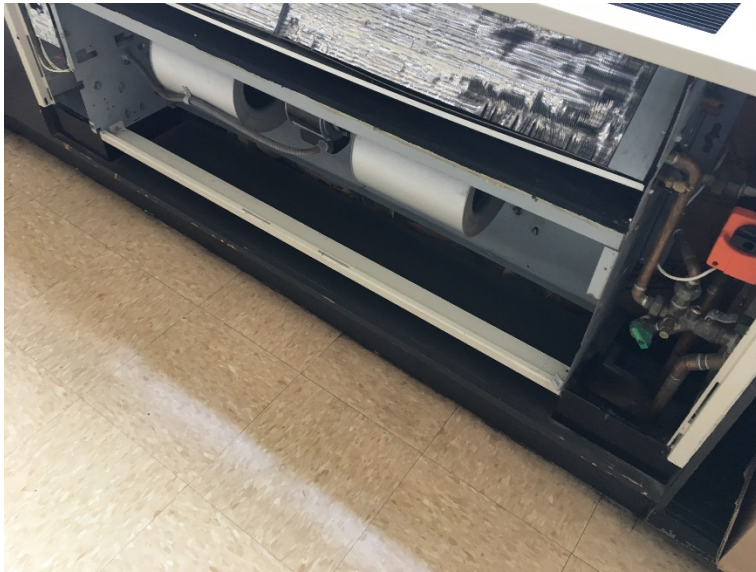
Photograph 4: Interior of Univent, Doherty Room 202