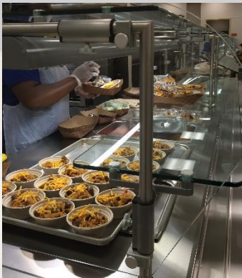
new Nelson Place preparation on site

http://www.wbjournal.com/article/20170620/HEALTH02/170629992