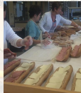
Fresh Sandwich production for fresh menu system