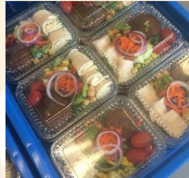
Turkey & Mozzarella Salads with Whole Grain Zucchini Greek Yogurt Muffin (local and seasonal)