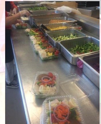
salad production at North High School