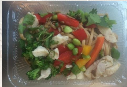
Asian Noodles with Chicken and Edamame