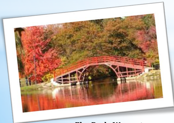
Elm Park, Worcester

*Not including Athletic Coaches or After School Programs