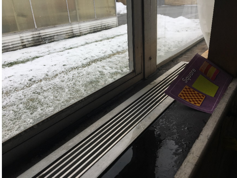
Photograph 5: Windowsill in room E8