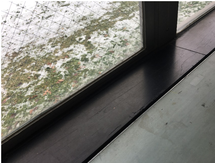
Photograph 4: Windowsill in band room