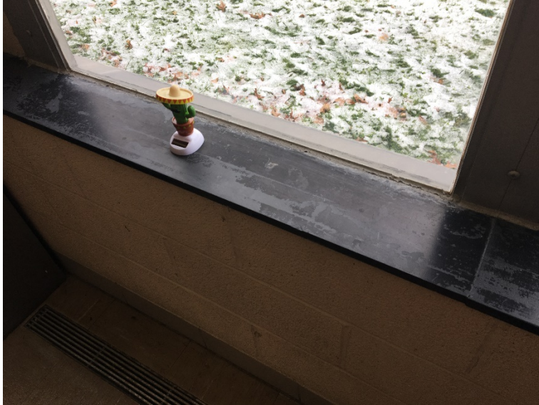
Photograph 3: Torn caulk, room B9