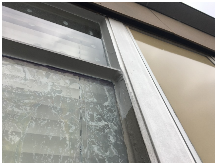
Photograph 6: Section of caulk on exterior window, showing original 2012 overcaulking (dark gray) and 2018 supplemental overcaulking (light gray)