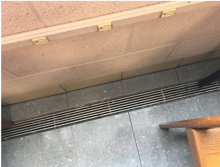
Photograph 2: Typical plenum vent, Room A6