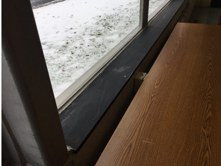
Photograph 1: Typical window sill, Room A6