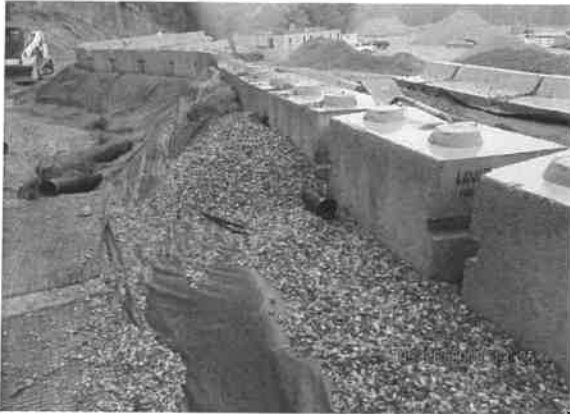
1. Construction of Enabling Package Retaining Wall