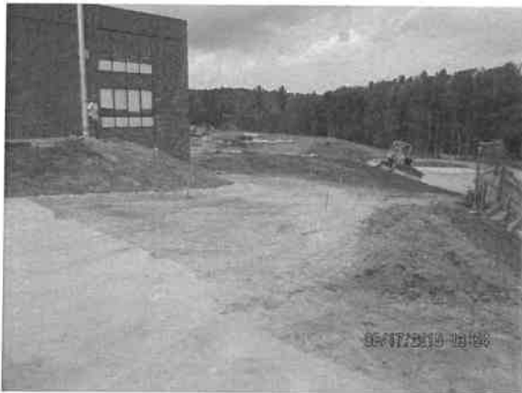
3. Ramp for Access Around School