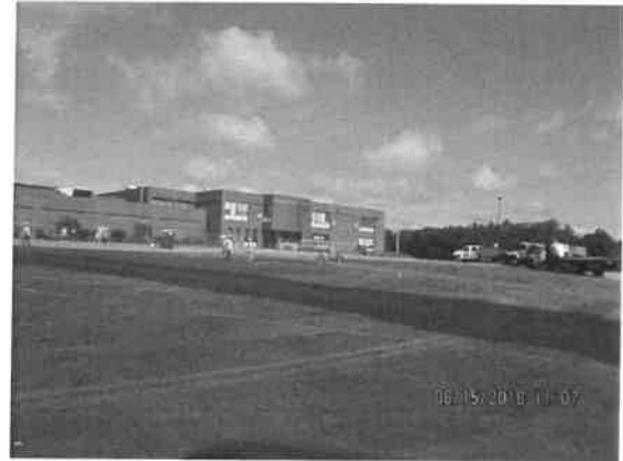
2. Parking Lot At Main Entrance