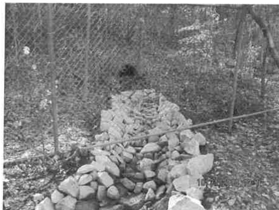
5. Completed Work at Outfall