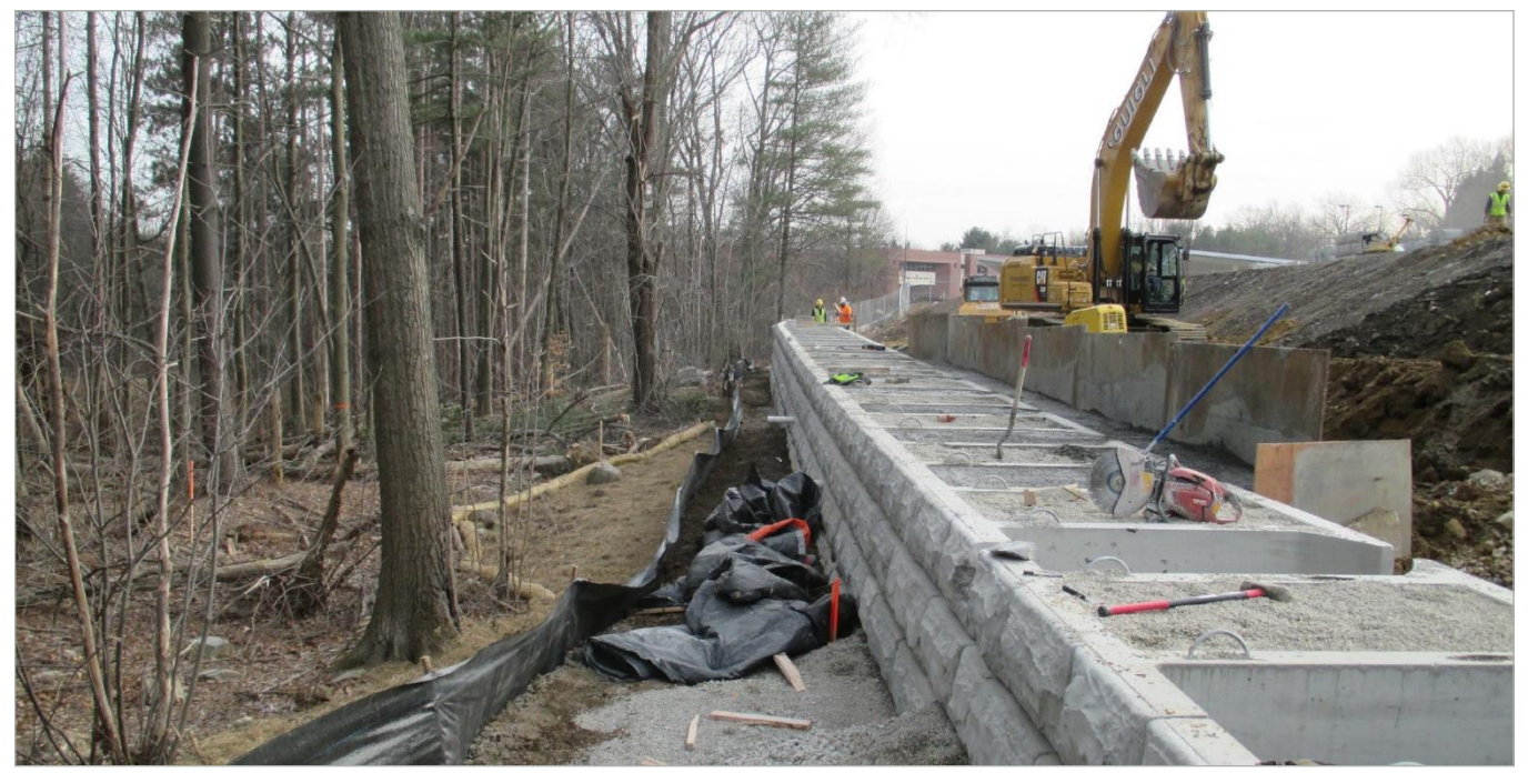
3. Big block retaining wall construction