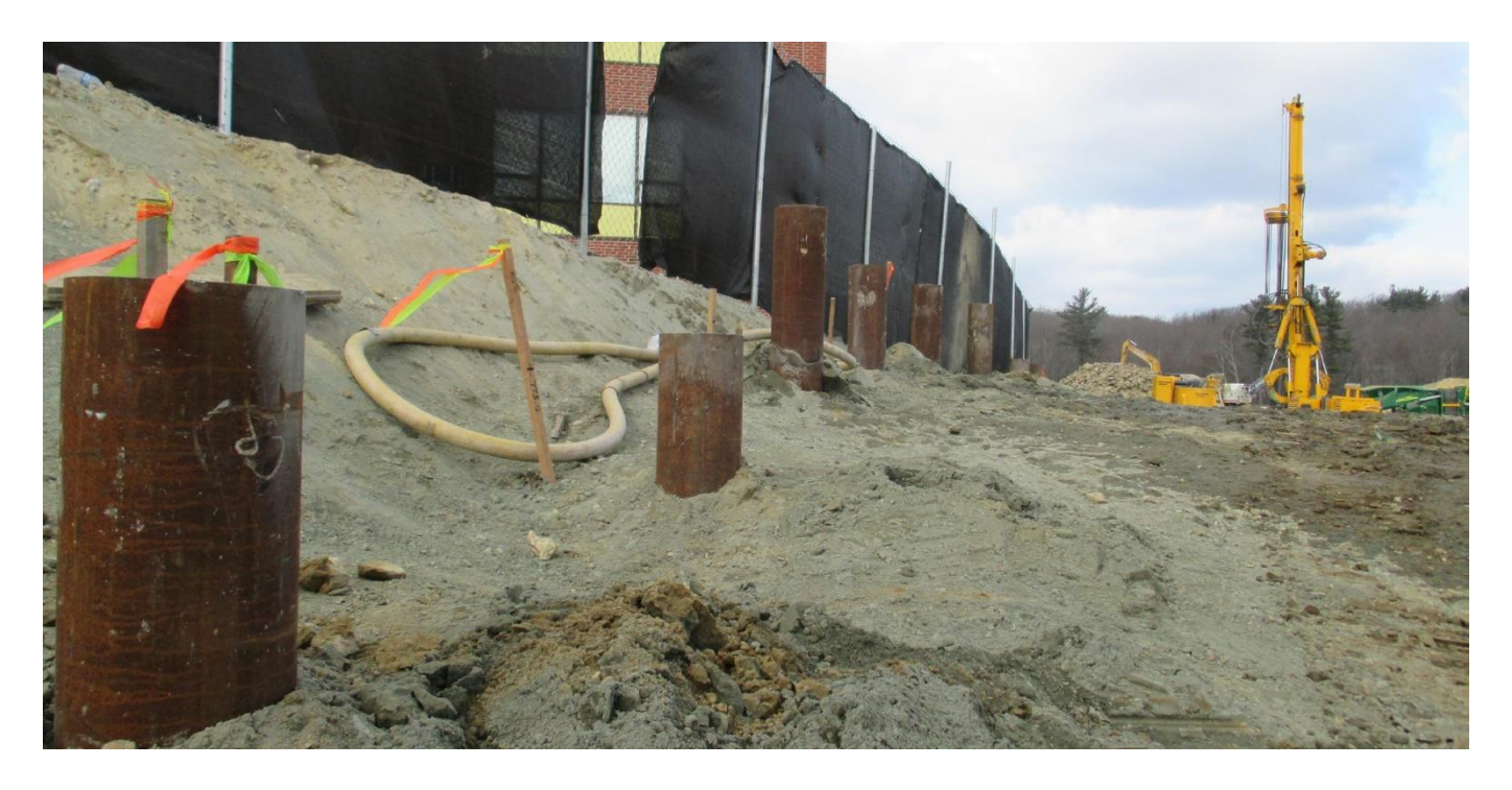
5. Piles installed for SOE system