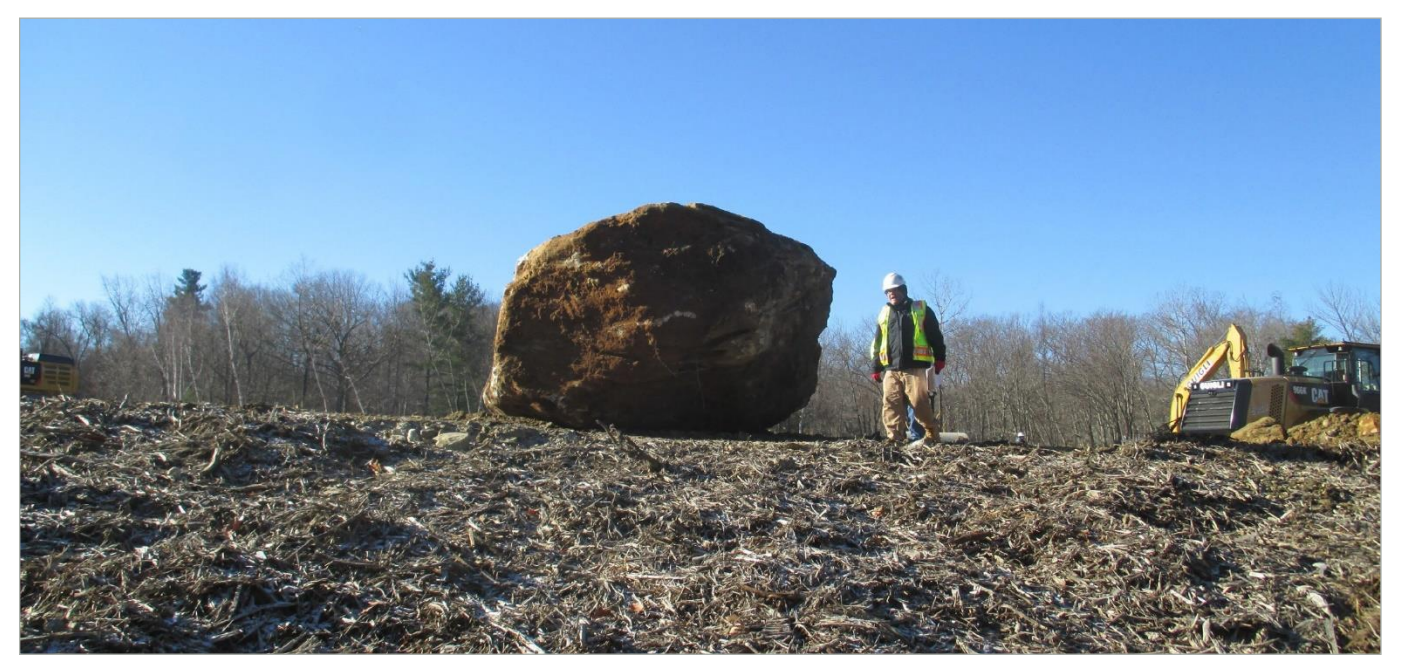
1. Several large boulders have been removed and crushed for use onsite