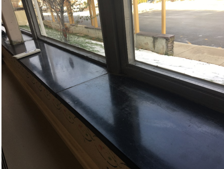
Photograph 1: Typical windowsill, front office