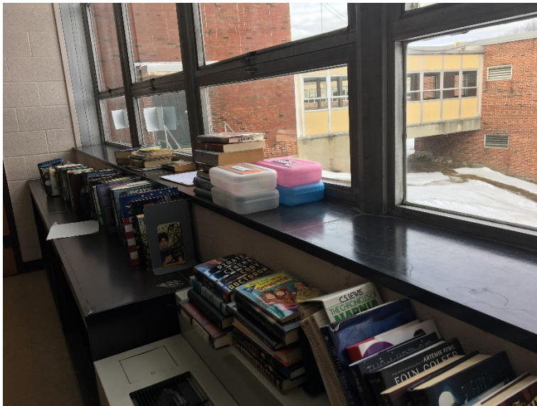
Photograph 6: Typical classroom, north face of 400s wing.