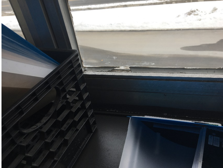
Photograph 3: Minor damage to caulk, room 209