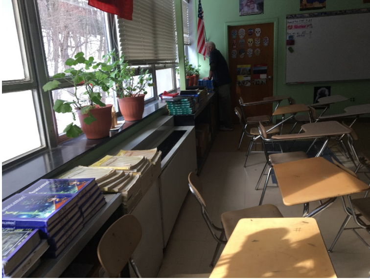
Photograph 5: Interior of Room 421