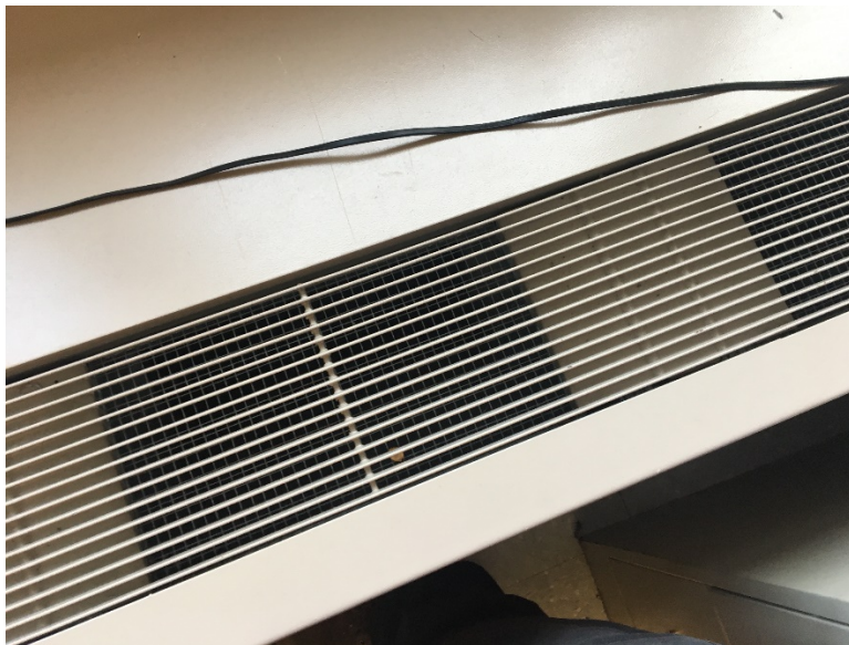
Photograph 2: Typical Univent, room 106