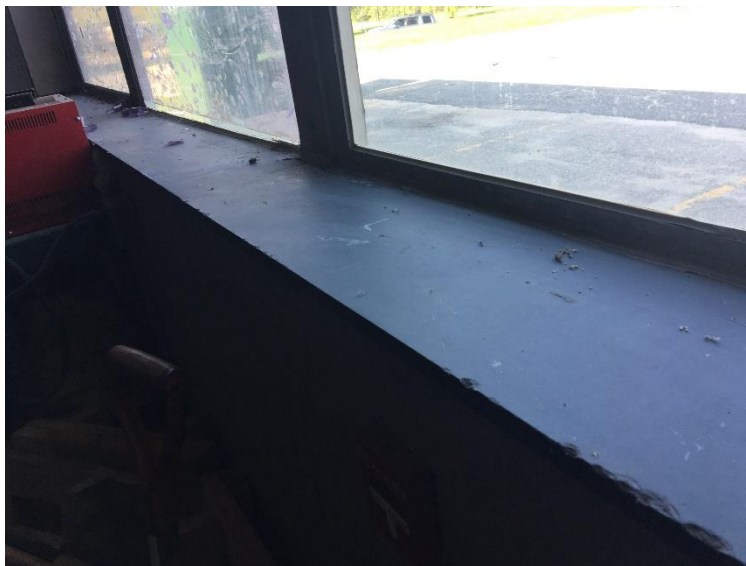
Photograph 4: Accumulated dust in QCC auto shop area