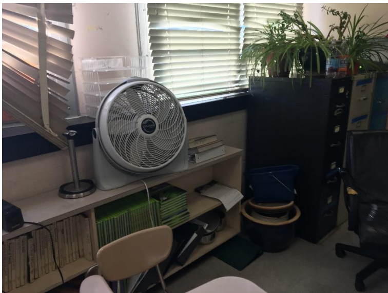
Photograph 6: Room E5A