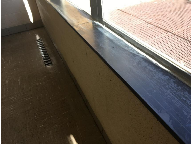
Photograph 3: Typical overcaulking, Room A16