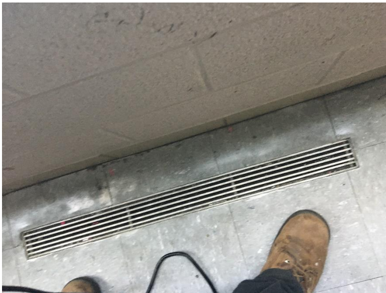
Photograph 2: Typical plenum vent, Room A5