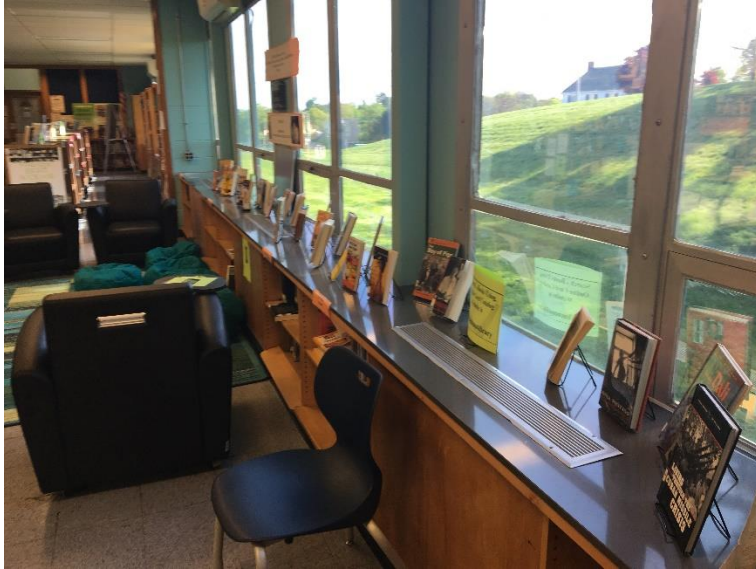
Photograph 5: Windowsill in Library