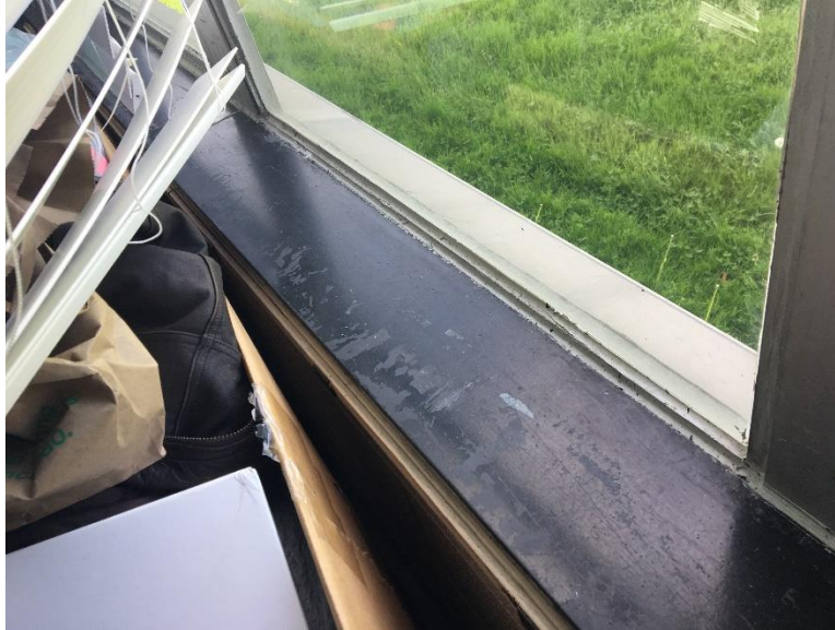
Photograph 1: Typical windowsill, Room A5