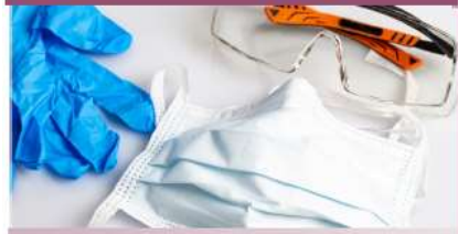
PPE, COVID Testing, Nurses