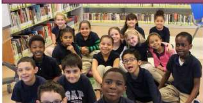
Enrollment Sustainability Funds