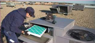
Ventilation System Maintenance