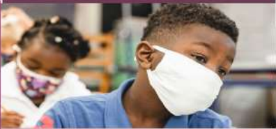
Summer and Afterschool Programs