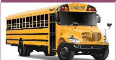
District-Operated School Buses