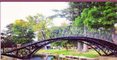
Student Opportunity Act Bridge Funding