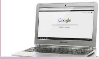
A picture containing text, indoor, computer, stack Description automatically generated